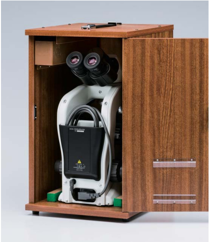
Dedicated wooden case (optional)